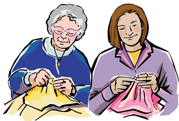
Prayer Shawl Ministry